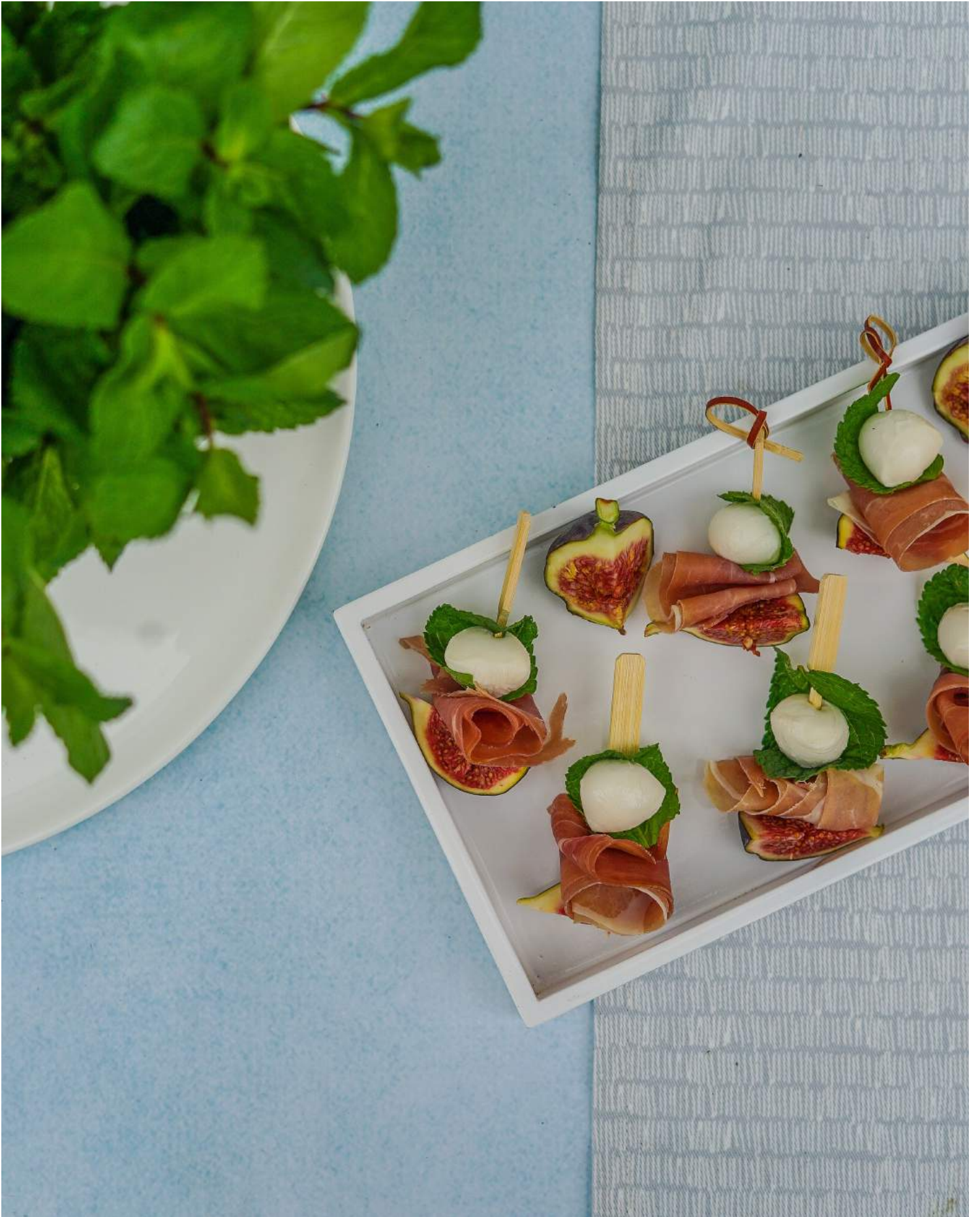
Product images are for illustrative purposes only and may differ from the actual product.